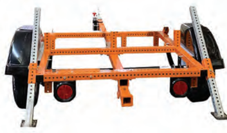
RSS60 | AGILE TRAILER