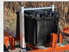
RSS60 | TRAILER