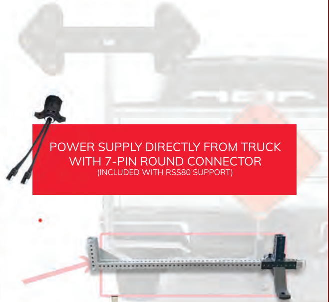
RSS80 | HITCH

POWER SUPPLY DIRECTLY FROM TRUCK WITH 7-PIN ROUND CONNECTOR (INCLUDED WITH RSS80 SUPPORT)