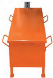
RSS44 | MOBILE PEDESTAL