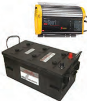
RSS44 | HOUSING