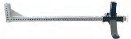
RSS80 | SUPPORT HITCH

Support coulissant pour attelage en acier galvanisé