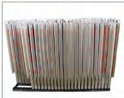
BALSUP2 . 2X30 SIGNS ON POST