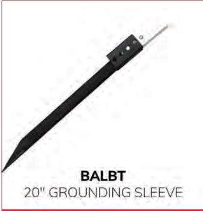
BALBT 20" GROUNDING SLEEVE