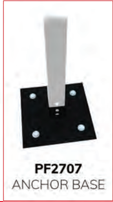
PF2707 ANCHOR BASE