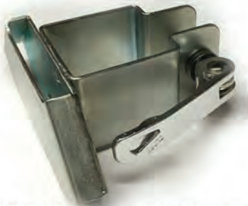
AE6036-06 . FOR SIGNAGE UP TO 6MM AE6036-10 . FOR SIGNAGE UP TO 10MM