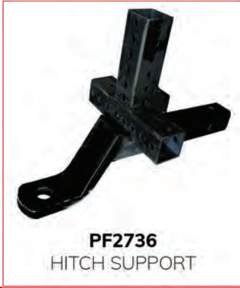
PF2736 HITCH SUPPORT

BALIPLAST POST IS ALSO COMPATIBLE WITH EFFIA SUPPORTS