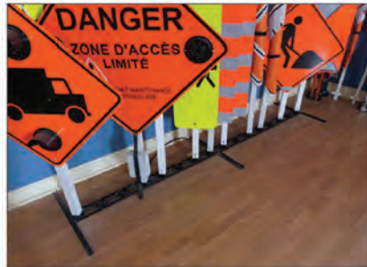
BALSUP1 . 16 SIGNS ON POST