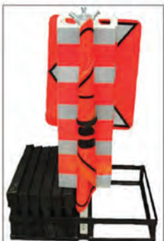
BALSUP3 . 12 SIGNS ON POST AND 12 WEIGHTS